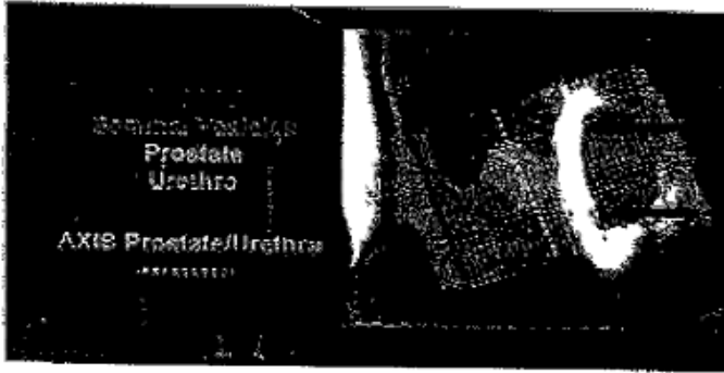
A Sixteen Regions of Interest